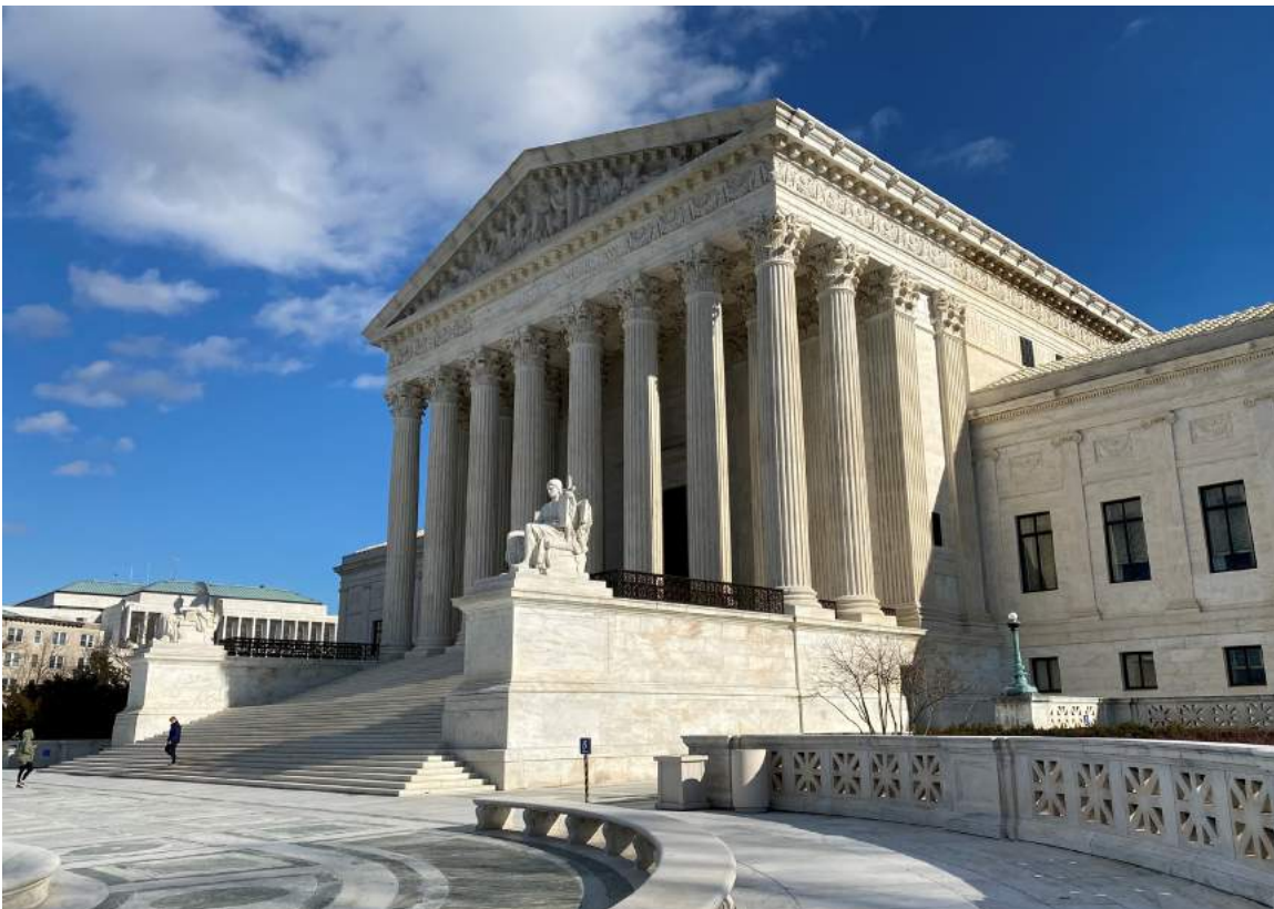
The building of the U.S. Supreme Court is pictured in Washington, D.C., U.S., January 19, 2020.

“A popular Government without popular information or the means of acquiring it, is but a Prologue to a Farce or a Tragedy or perhaps both. Knowledge will forever govern ignorance, and a people who mean to be their own Governors, must arm themselves with the power knowledge gives.”