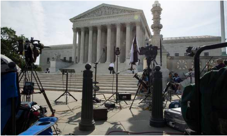
Television cameras are seen in front of the Supreme Court in Washington June 19, 2014. The U.S. Supreme Court on Thursday ruled that implementing an abstract idea using a computer does not make an invention patent eligible.

“I think the case is so strong that I can tell you that the day you see a camera come into our courtroom it’s going to roll over my dead body.” — U.S. Supreme Court Justice David Souter in 1996 to a Senate subcommittee