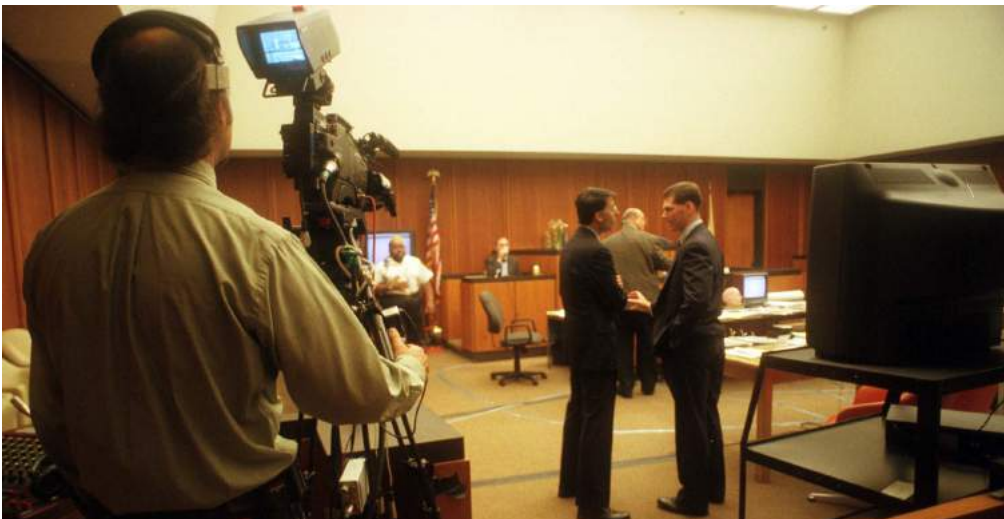
Lawyers confer in the courtroom in Cambridge October 10 where British nanny Louise Woodward is being tried for the murder of nine month-old Matthew Eappen. Unlike in England, TV and still cameras are allowed in the courtroom to cover the trial.