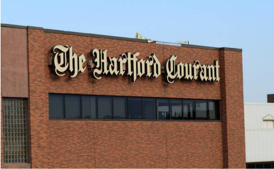
The Hartford Courant building in downtown Hartford, seen from I-84 East. 30 June 2009.